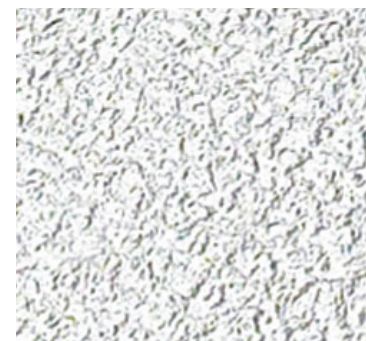
Kasumi Textured Glass