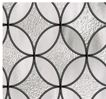
High Point Tru® Elegance Decorative